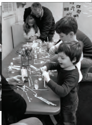
Willy Wonka Party