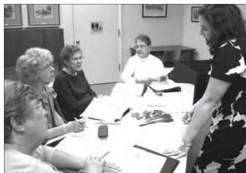
Preserving Family Recipes