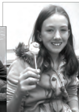
Fun with Cake Pops